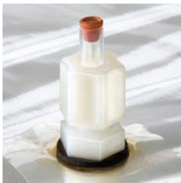
TN4, Tube Septum, Nylon