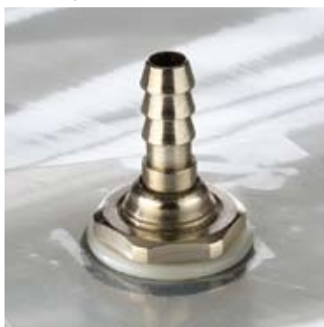
HBL, Halkey Roberts, On/Off Valve