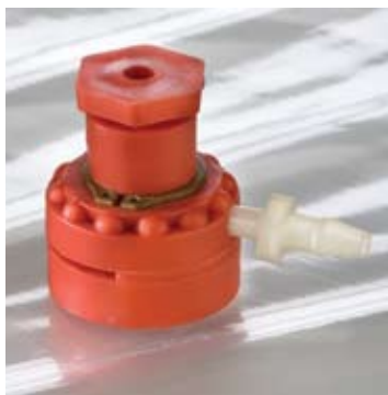
UK4, On/Off Septum, Kynar Dual Valve