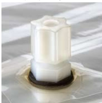
JN4, 1/4" Nylon Septum fitting